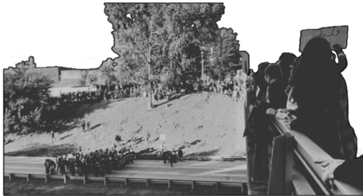
Demonstrators in Durham, North Carolina shutting down Highway 147 at rush hour on November 2, 2023. At the same time, demonstrators in Philadelphia were shutting down 30th Street Station.

Israel's "right to defend itself." But to stop the genocide in Gaza, activists in the United States will have to move from demanding a ceasefire to imposing one. This will require a shift from demands that appeal to the consciences of elected officials to tactics that create a political crisis for politicians and disrupt corporations' ability to profit from the oppression and genocide of Palestinian people.