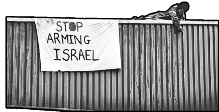
A Palestine Action protester occupied the roof of Howmet Fastening Systems in Leicester, United Kingdom. Howmet makes components for Israeli F-35s.

infrastructure appear to represent an intentional strategy in which civilians and the resources they depend on become the primary targets of war. This suggests that the strategy of disproportionate force Israel developed in Lebanon is implicated in the devastating loss of life and life-giving infrastructure in Palestine.