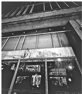
The Cambridge facility of the arms dealer Elbit System sprayed in red paint on October 16, 2023 in solidarity with those suffering in Palestine.

Though the number of Jews who have mobilized across the United States over the past four weeks is impressive, neither the demands they have presented nor the devastating civilian death toll in Palestine have swayed the decisions of elected officials.